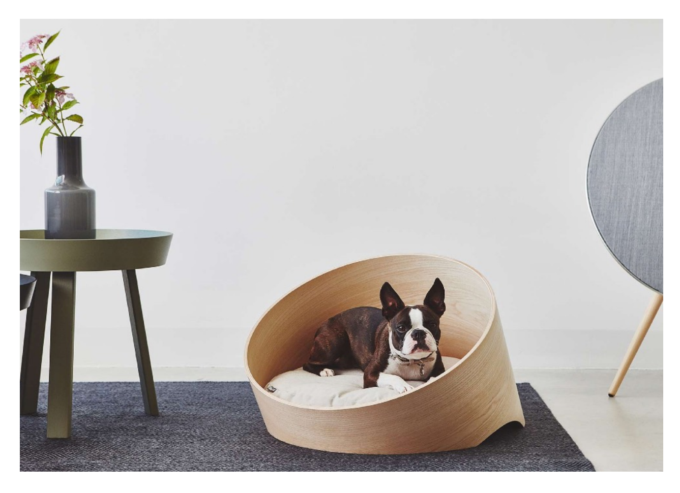
Covo Dog Basket