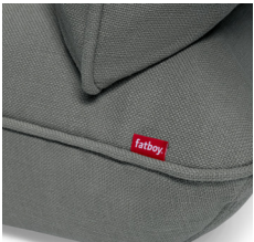
FibreGuard stain resistant technology