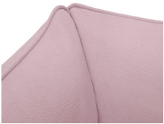
Washable and replaceable covers