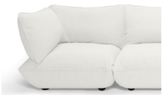
Easily to assemble