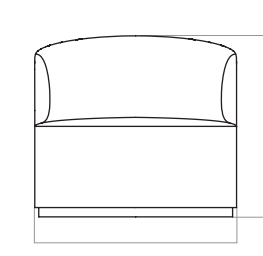
D: 70 cm / 27,6"