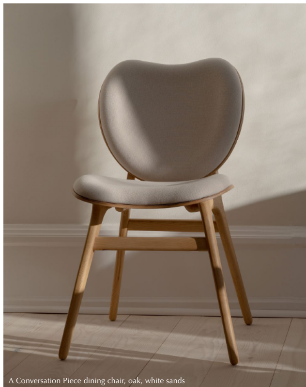
A Conversation Piece dining chair, oak, white sands

With the same soft and organic outline known from the lounge chair collection, the A Conversation Piece dining chair combines elegance and functionality with craftsmanship. Made from solid oak and oak veneer, its airy, sculptural design is enhanced by subtle details like its rounded legs and seamless joints on the backrest, demonstrating meticulous attention to detail, adding warmth and character to any space.