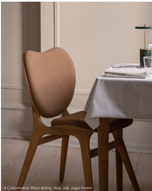
A Conversation Piece dining chair, oak, sugar brown