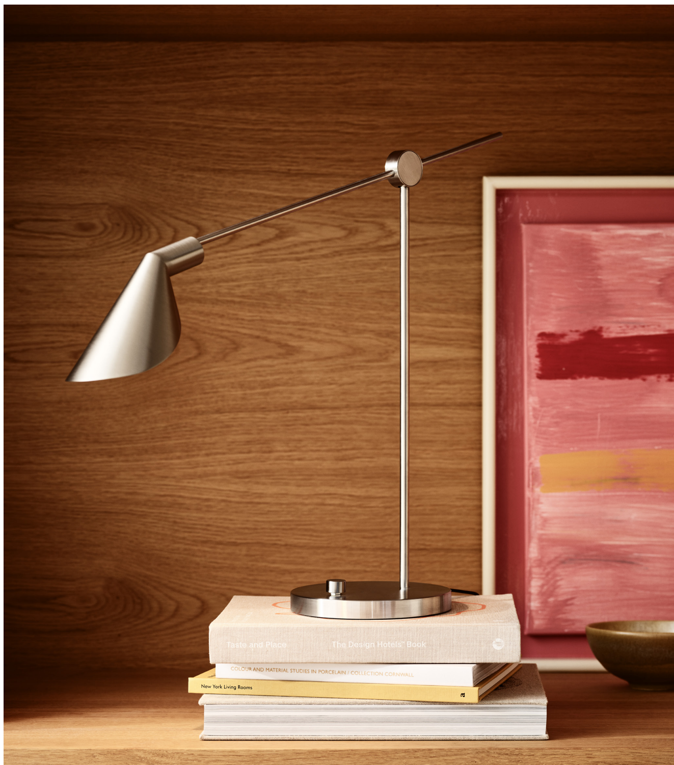
MS SERIES - MS021 PRODUCT FACT SHEET