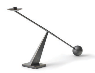
BRONZED BRASS 4709859