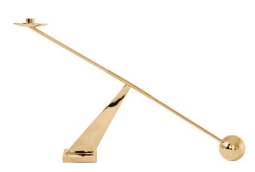
POLISHED BRASS 4709839