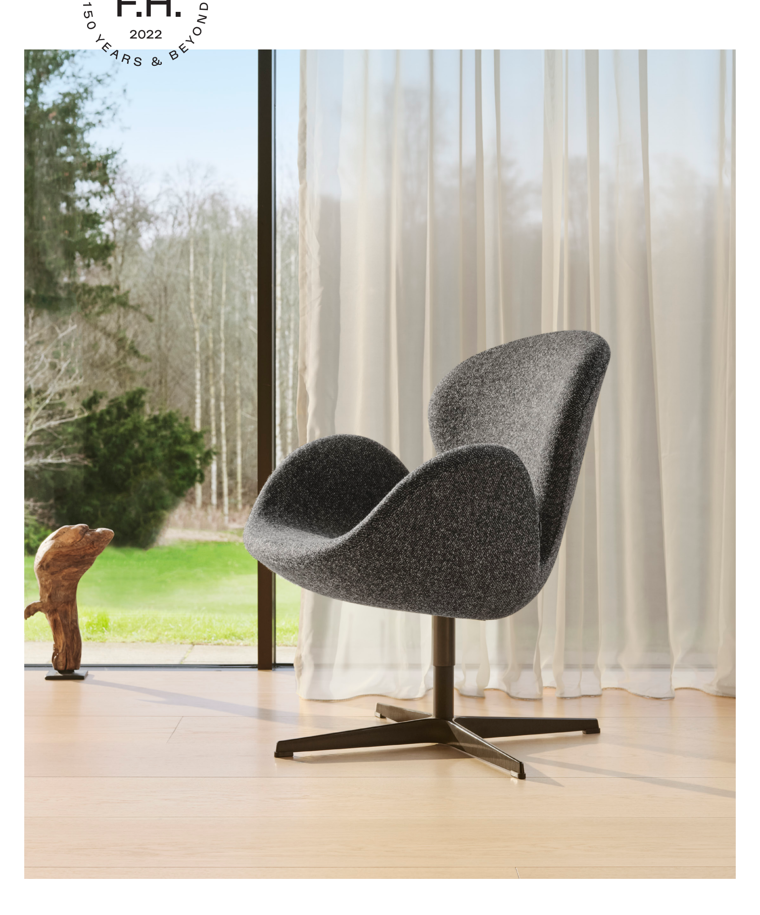
SWAN™ - ANNIVERSARY COLLECTION PRODUCT FACT SHEET