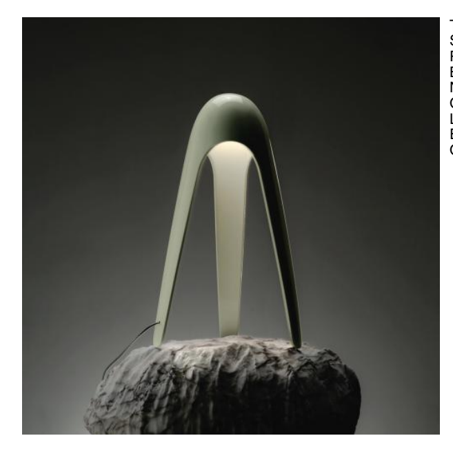
TABLE LAMP DIRECT DIFFUSED LIGHT. STRUCTURE OF CAST ALUMINIUM PAINTED IN COLORS WHITE, CLEAR BLUE, LIGHT LIME, LIGHT GREY AND NATURAL ALUMINIUM COLOR. WHITE OPAL POLYCARBONATE DIFFUSER. LED LIGHT SOURCE INTEGRATED. ELECTRONIC DRIVE ON THE PLUG. ON-OFF TOUCH SENSOR.