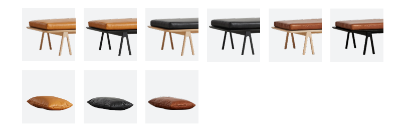
L 1900 x D 765 x H 410 mm L 74.8 x D 30.1 x H 16.1 "