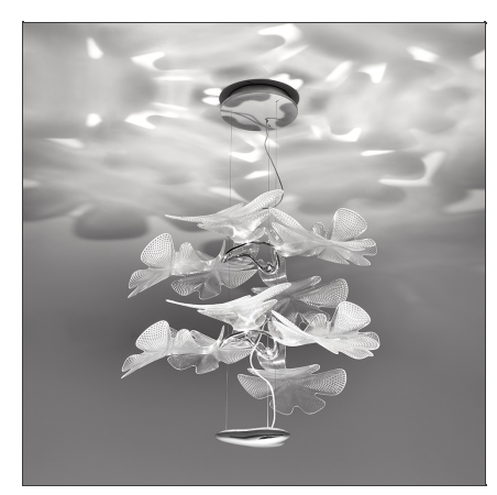
IP 20 (<u>↓</u>) c€