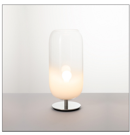
IP20 (≟) 🐒 € C€