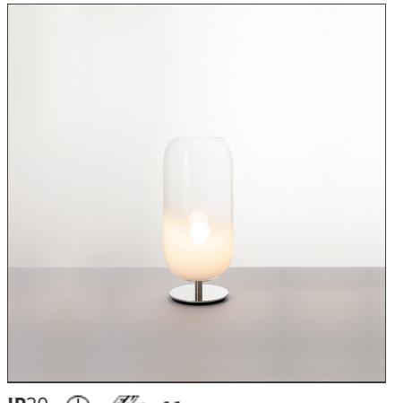
IP20 🔔 🔣 🕫 CE