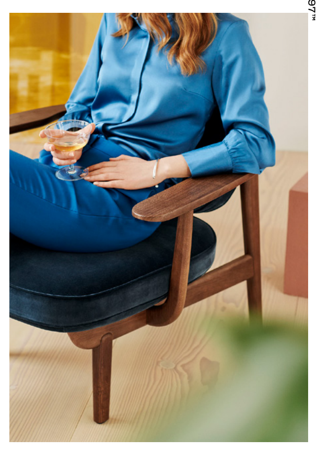
LOUNGE CHAIR JH97™ IN WALNUT STAINED OAK & HARALD 3 (VELVET) 182