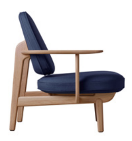
BLACK PAINTED ASH