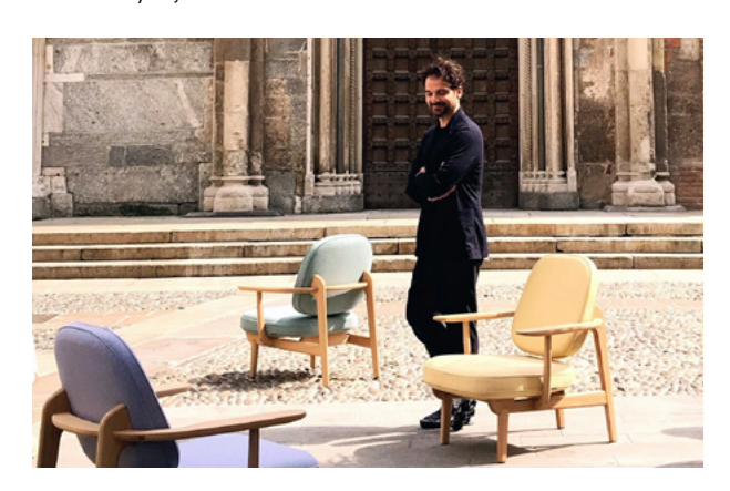
DESIGN Jaime Hayon, 2019