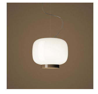
Chouchin Reverse 3