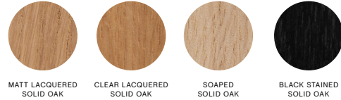
MATT LACQUERED SOLID OAK