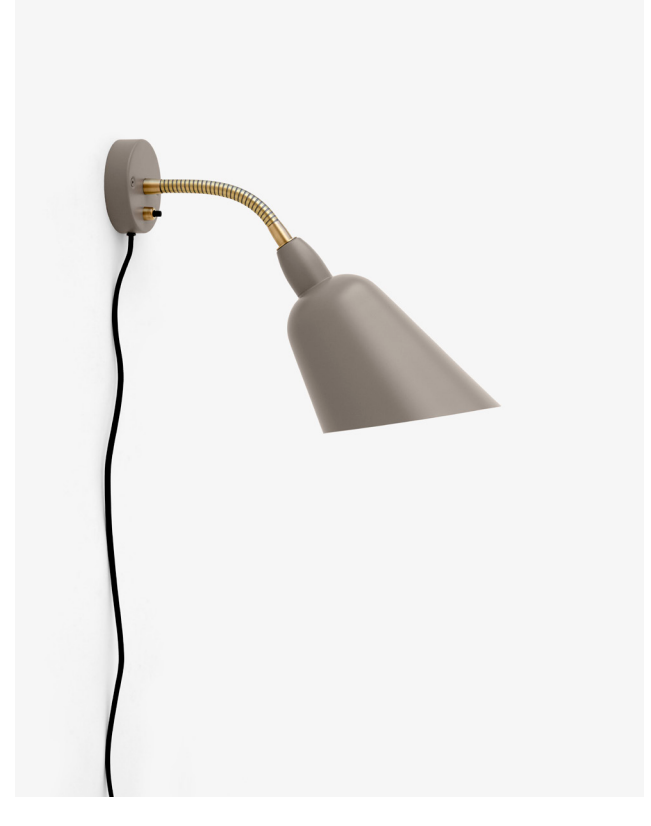
Grey beige / brass