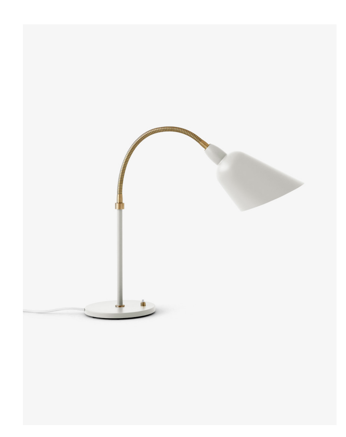
Grey beige / brass