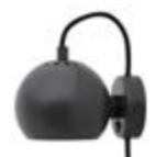
Matt dark grey. Art.no. 104740