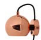
Glossy copper. Art.no. 104744