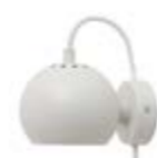
Matt white. Art.no. 104756