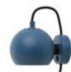
Matt petrol blue. Art.no. 104739