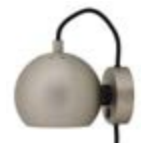
Matt brushed satin. Art.no. 104751