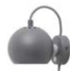
Matt light grey. Art.no. 104747