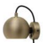
Matt antique brass. Art.no. 104741