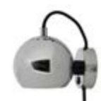
Glossy chrome. Art.no. 104753