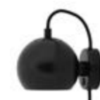
Matt black. Art.no. 104755