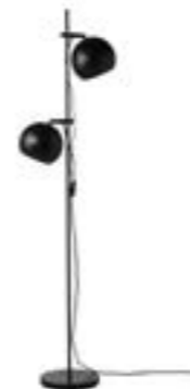
Body black: art.no. 108015 Spots black: art.no. 108018