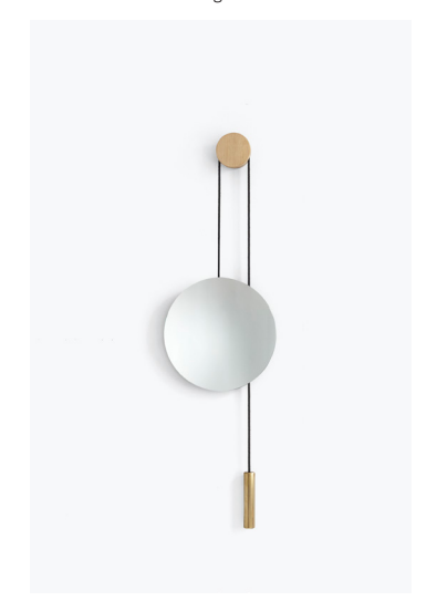
Natural oak w. brass weight