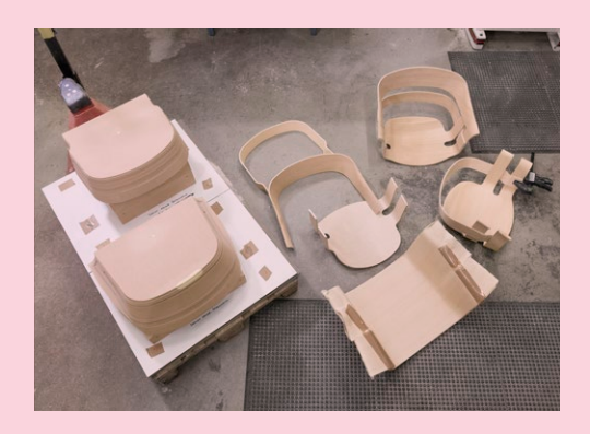
Wick Chair is manufactured in Nybro, in the Swedish furniture industry's heartland.