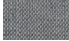
Sunniva 2 242 In stock