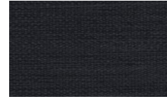
Balder 3 192 In stock