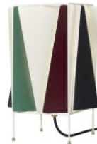
// Salvie Green