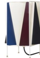
// French Blue