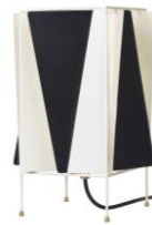
// Black & White