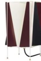
// Wine Red