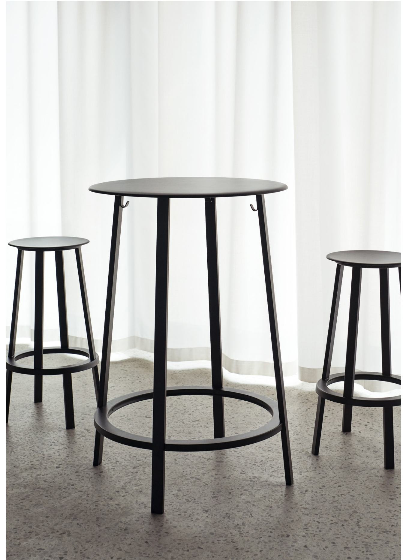
Revolver Table | Black powder coated steel