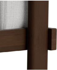
Brown Stained Pine (FSC™ C163461)