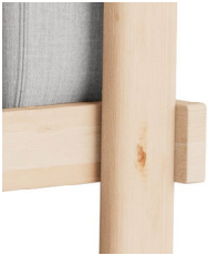
Pine (FSC™ C163461)