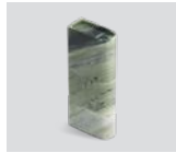
Tall green marble - Item no. 3126