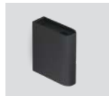
Wall black - Item no. 3135