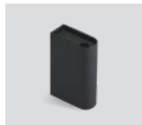
Medium black - Item no. 3133