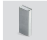
Tall aluminium - Item no. 3130