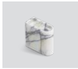
Low white marble - Item no. 3120