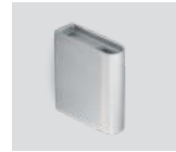
Wall aluminium - Item no. 3131