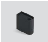
Low black - Item no. 3132