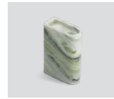
Medium green marble - Item no. 3125