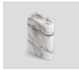
Medium white marble - Item no. 3121