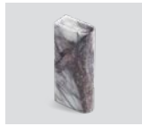
Tall white marble - Item no. 3122