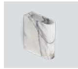
Wall white marble - Item no. 3123