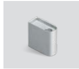
Low aluminium - Item no. 3128