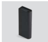
Tall black - Item no. 3134