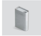
Medium aluminium - Item no. 3129