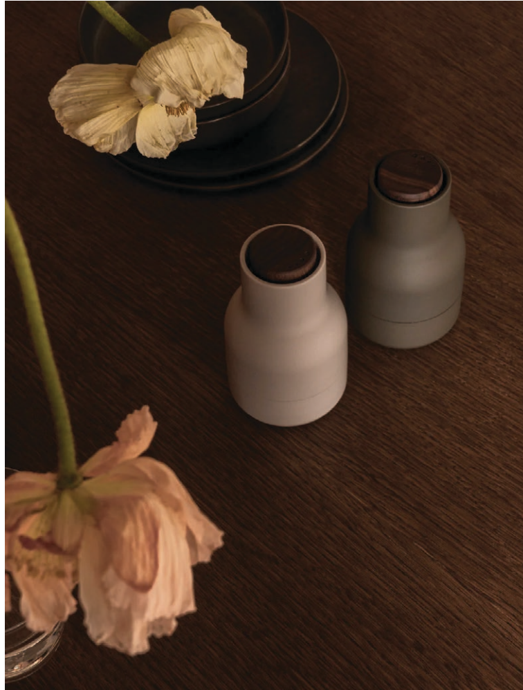
BOTTLE GRINDER, SMALL, 2 PACK Designed by Norm Architects