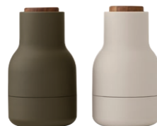
HUNTING GREEN/BEIGE 4413459