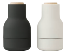
ASH / CARBON 4413399